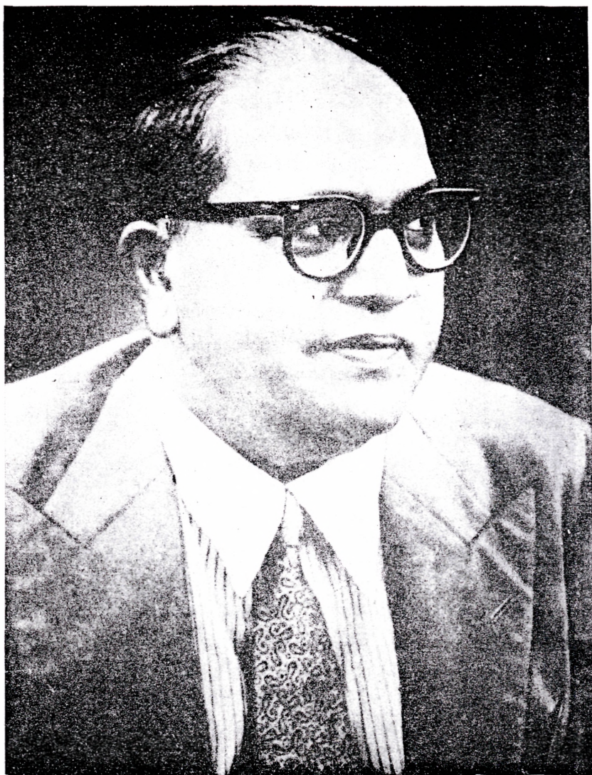
Dr. BABASAHEB AMBEDKAR