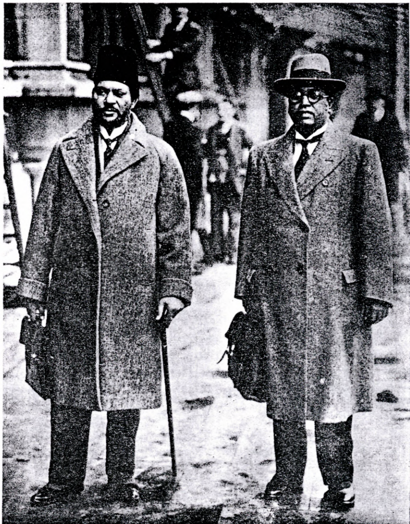
Dr. Ambedkar with Mr. Muhammad Zafrulla Khan arriving at the House of Lords for the Third R. T. C. in 1932